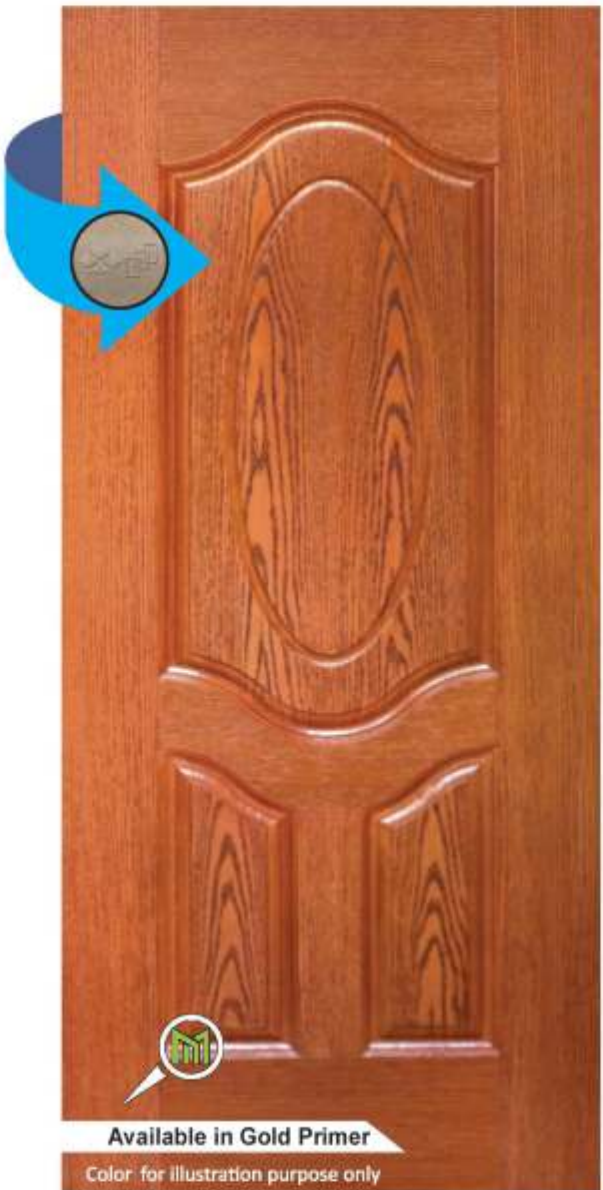
3-PANEL OVAL TEXTURE

This American design has distinct moulding quality, and unique high definition and panel profile. Its moulding introduces architectural accent like no other door