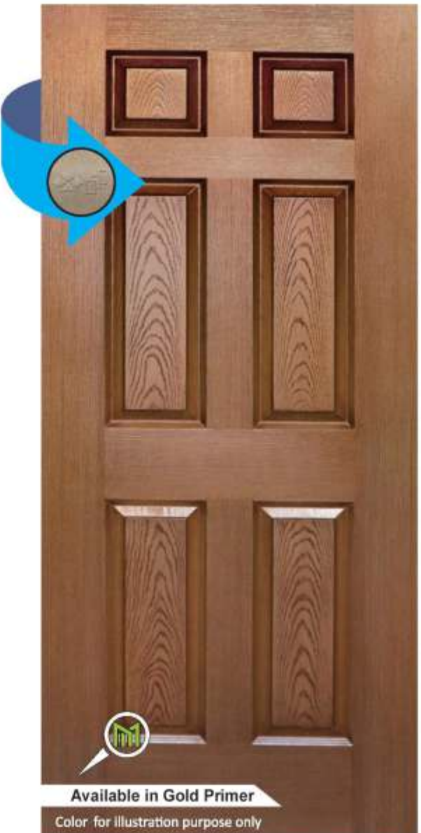
6-PANEL PINE TEXTURE

This unique design embossed with the fine texture of mahogany beautifully captures the inlaid panel details of a true stile and rail wooden door