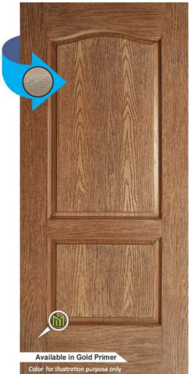
2-PANEL OAK TEXTURE

A deep bold texture surface combining three variations of natural Oak grain patterns