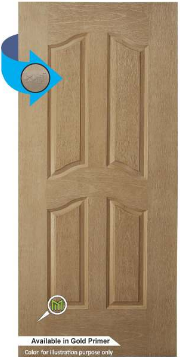
4-PANEL MAHOGANY TEXTURE

It highlight interiors with the beauty and refinement of natural wood. Deep wood-grain texture and distinctly raised moulding heightens the unique style of the premises