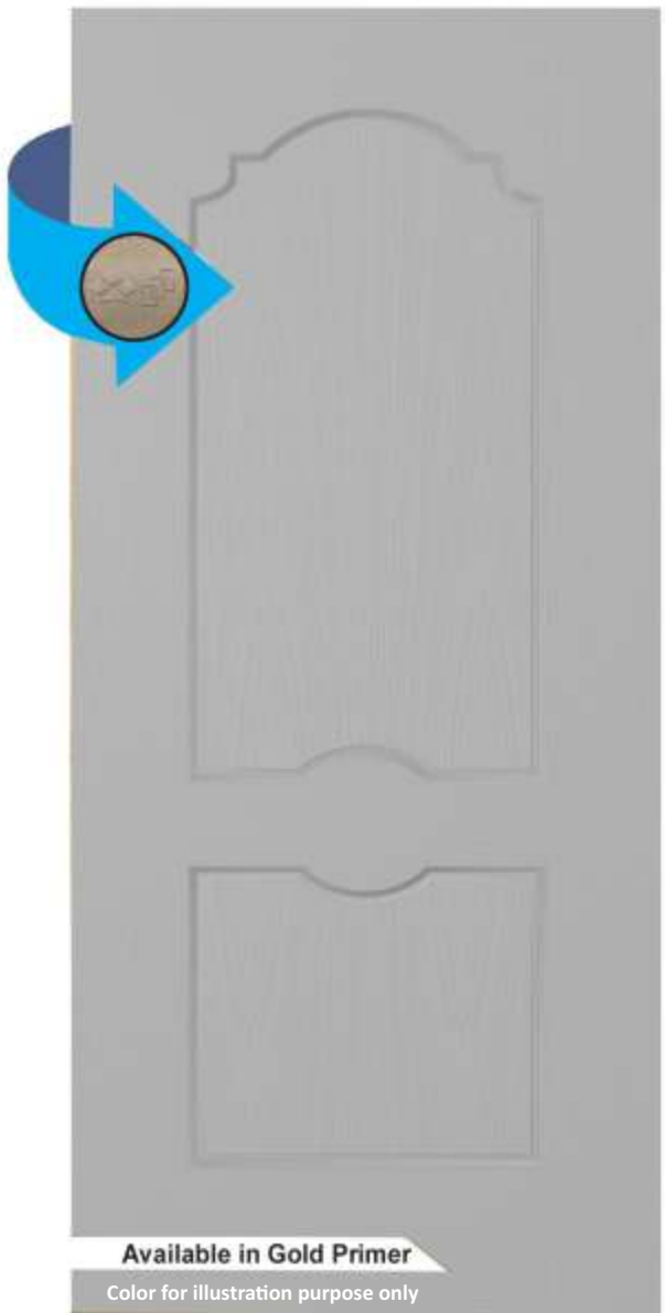
2-PANEL HORIZON TEXTURE

Distinguished by its singular arched crown design it evokes aristocratic origin and beautifully captures the details of a two-panel stile and rail wooden door