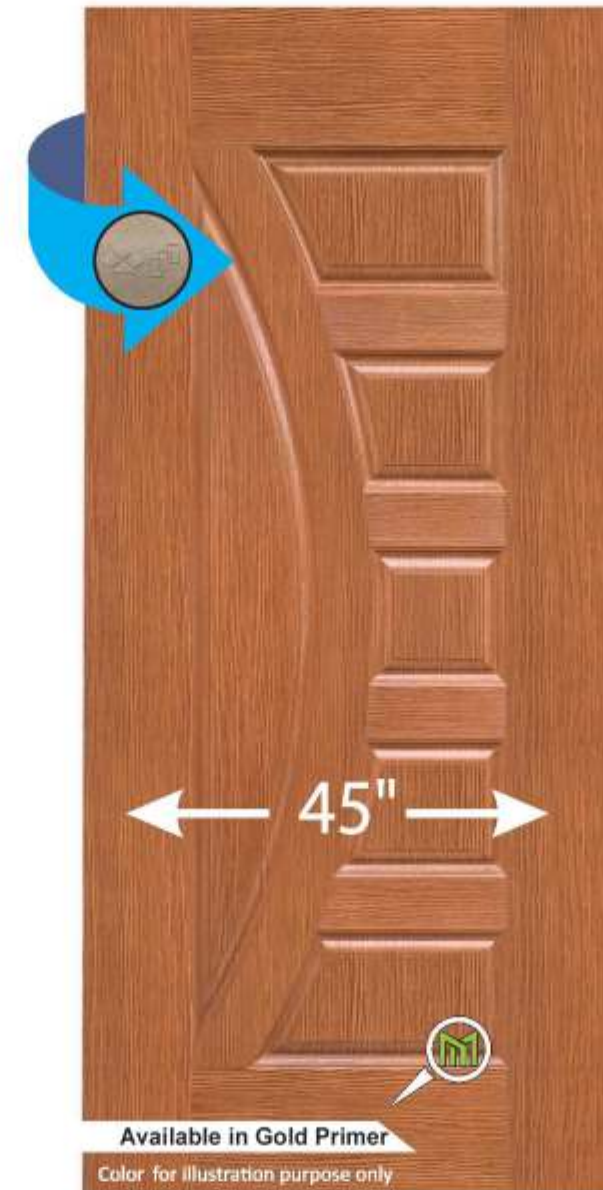
6 PANEL CLIFTON

Available in Gold Primer Color for illustration purpose only