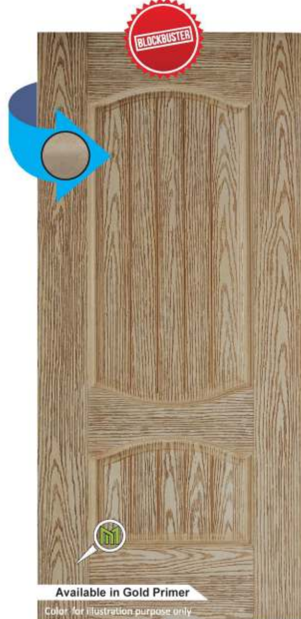
2 PANEL BRISTOL™

Available in Gold Primer Color for illustration purpose only